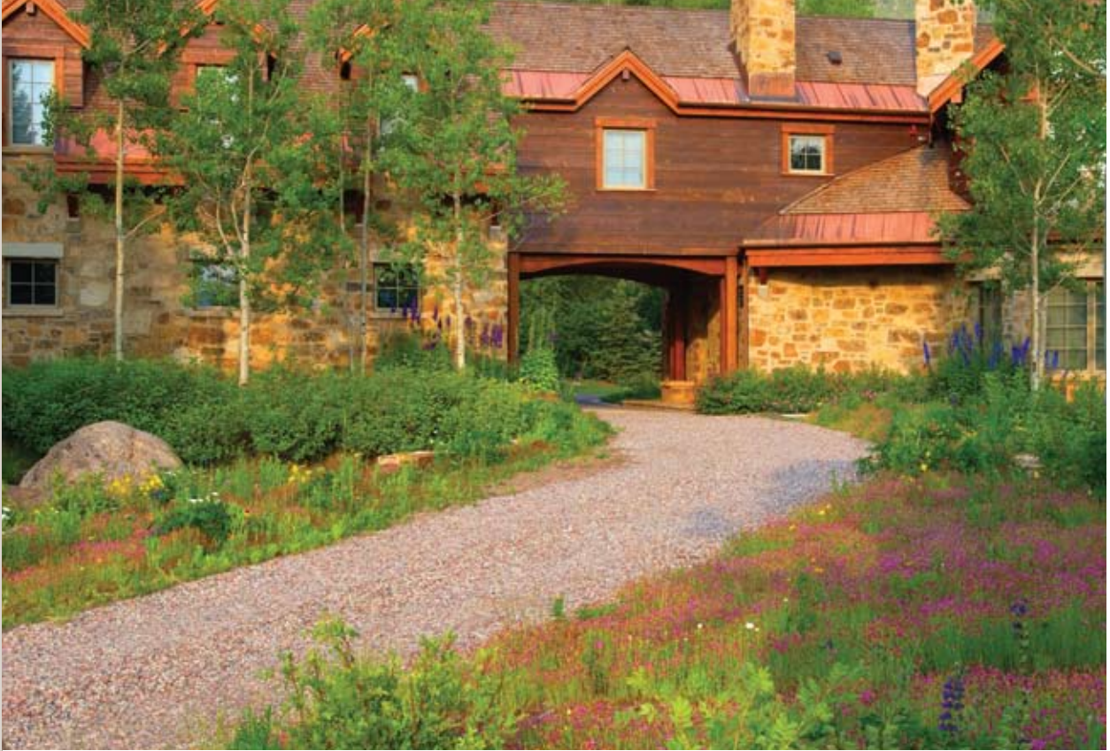
Streamside Estate, Aspen, Colorado